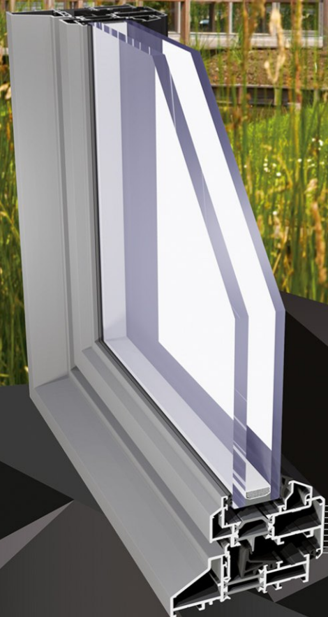
Steel Look window